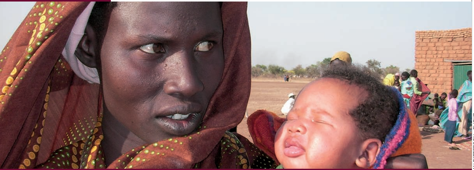
DAN PATTERSON - FLICKR